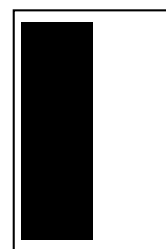
Half Page Portrait 200 x 65mm