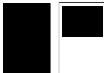
Full Page Trimmed 210 x 148mm

Please supply all relevant information and images for us to be able to create this for you.